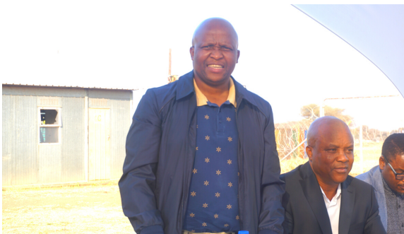
MEC Madoda Sambatha HEalth : North West

Dept of Health and Mine discussions on new clinic at Baphalane continues, the MEC Sambatha has indicated possible involvement of Government on construction of new Health Centre in the long run. The site allocated by Baphalane Traditional Council for construction of the Health Centre meets criteria for Department of Health, as consultations continue.